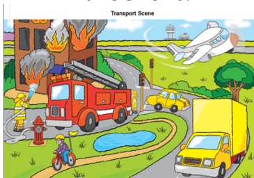
(Weeks 1 & 2)

Transport – Picture discussions, focus on vocabulary. Look at the scene and follow the instructions.